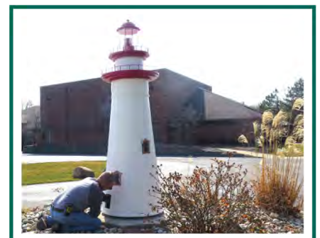
Photo-Cell Lights Campus Entrance Funded entirely by a major donor in 2009, the Marblehead replica took a year to build.