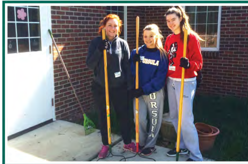
For the 10 th year in a row, St. Ursula Academy students served a 'Day of Caring' with residents at River Crossings.