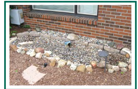
Close Up View of Mini-Pond The mini-pond once boasted a water feature; this also needs troubleshooting.

Most of the infrastructure that originally comprised our sensory garden is still intact. We hope to find a creative, attentive altruist to freshen up the area with new plants, troubleshoot the lighting and water features, and generally add a fresh perspective to this campus common area.