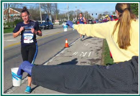
Josina Lott residents, staff, and volunteers manned the water stop at the 17 mile mark of the marathon.

The sun smiled brightly from a bright blue canvas on us along the 17 mile mark of the April 24th, 2016 Mercy Health Glass City Marathon. It was a beautiful race day morning with temperatures ranging between 40 – 50 degrees for the at the start of the race. In fact, more than one marathoner was overheard saying that, for running, “you couldn’t ask for better race weather.”