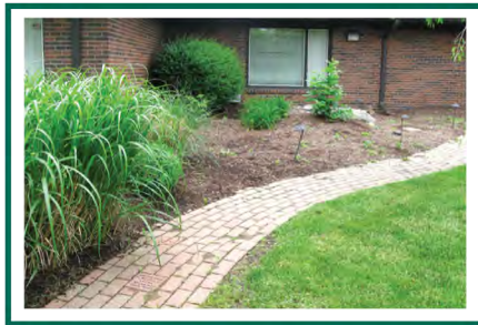
Sensory Garden Area The sensory garden is located behind the East Residence and is in need of TLC.

Do you know a landscaping enthusiast, hobbyist, student, or scout member looking for a fun, short-term outdoor pet-project this summer?