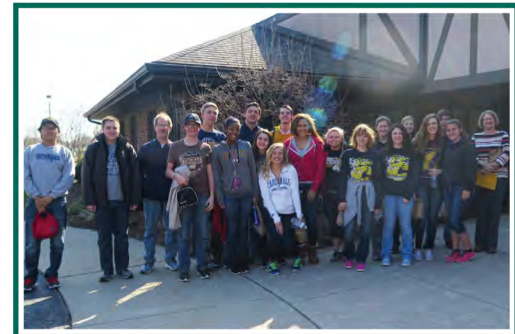
Toledo Christian students volunteer at Josina Lott as part of the TCares Community Outreach Program.

And a special thanks to students from Toledo Christian for volunteering their time to support our residents participating in the packet stuffing for the Glass City Marathon. We sincerely hope the students enjoyed their time on the campus of Josina Lott as much as we enjoyed having them!