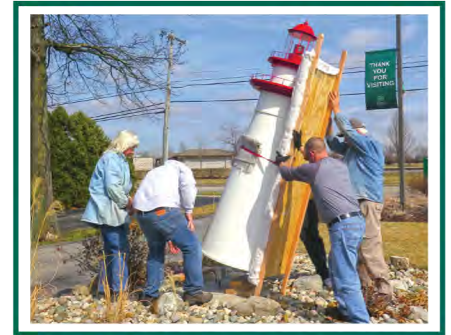
Four Men and a Homemade Stretcher The replica is a behemoth! It took four people to set the lighthouse back into place.