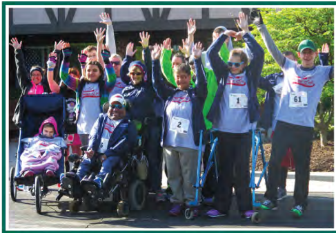
Inclusive Miles runners and their mentors practice all year to shine at home in the Jog & Jaunt 5k/10k.

For the second consecutive year we welcomed over 100 registered runners, walkers, and rollers to the Josina Lott campus. Athletes were greeted by chilly early morning temperatures